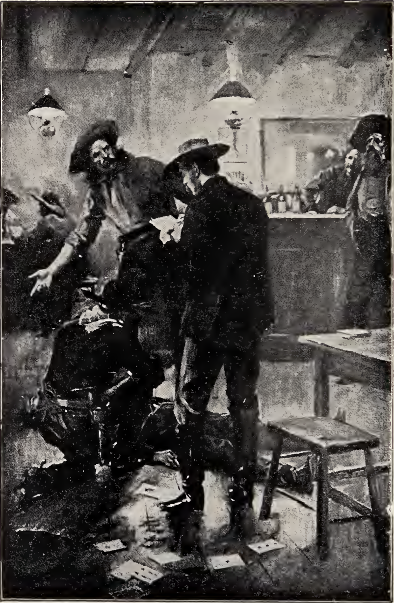
AN INFERIOR SORT OF A MURDER